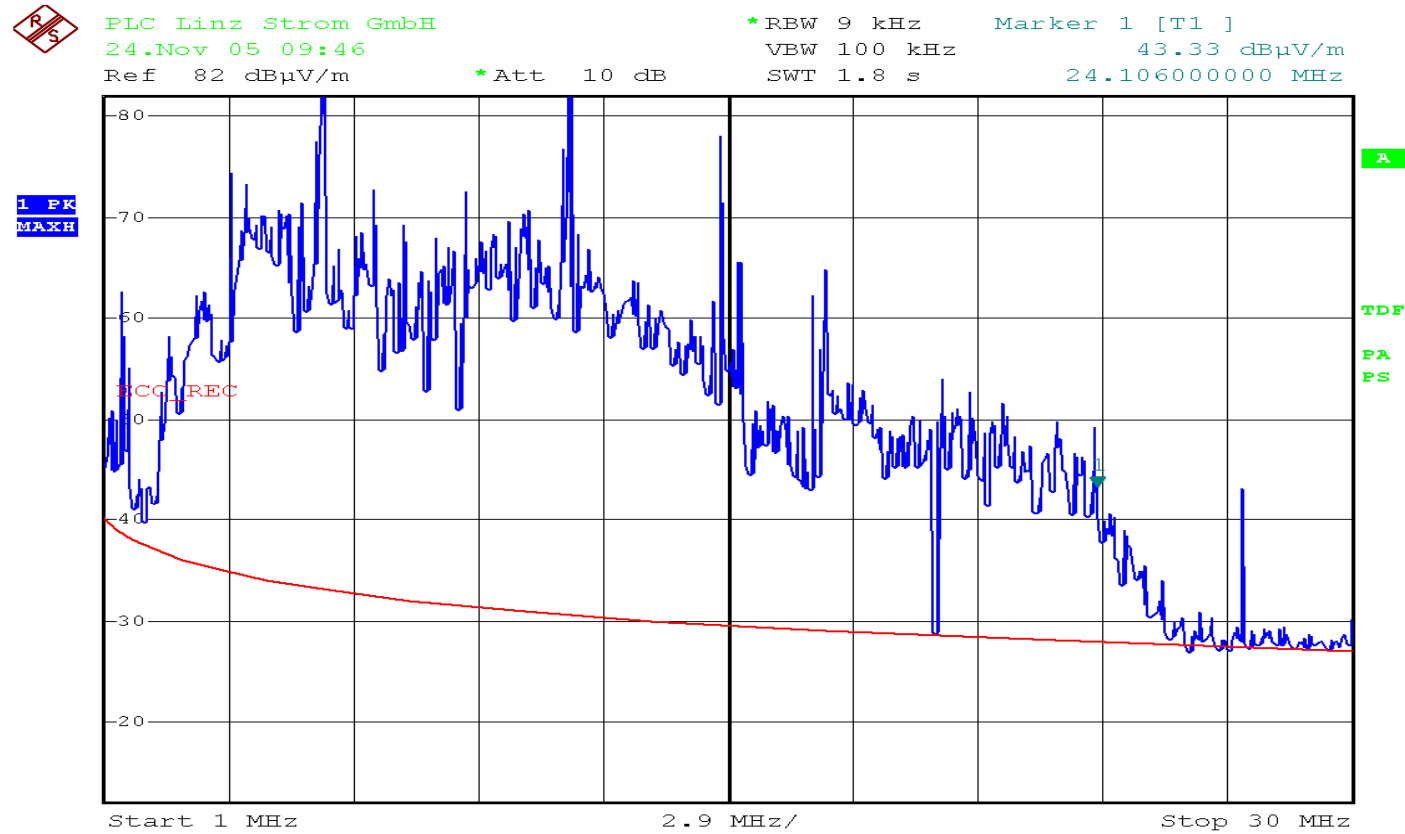
Figure 2: Radio spectrum emitted by PLC installation (measured in open area in a distance of 3 m from power supply line carrying PLC signals). Spikes are intended radio signals emitted by licensed radio transmitters. The line on the bottom presents the limits according to CEPT ECC/REC/(05)04).