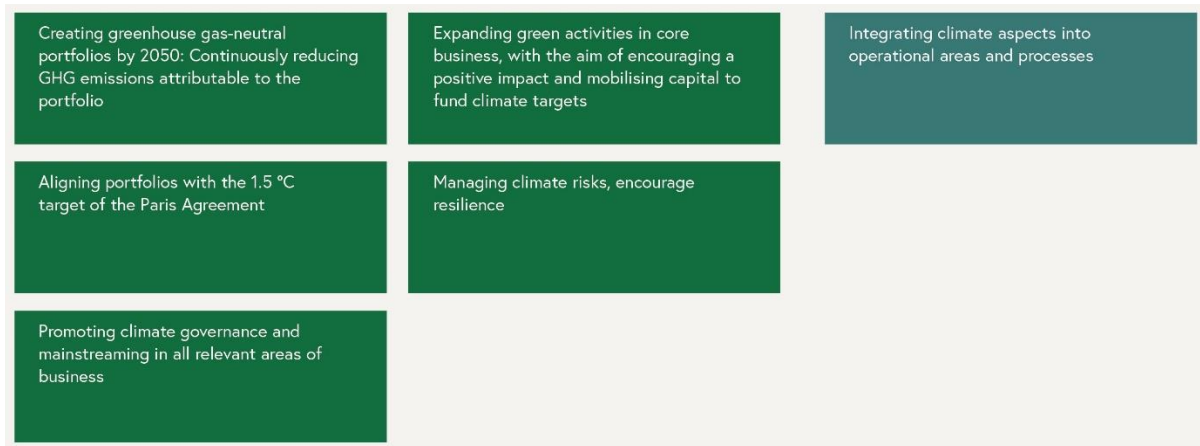
Figure 2: Target dimensions of the GF-Alliance